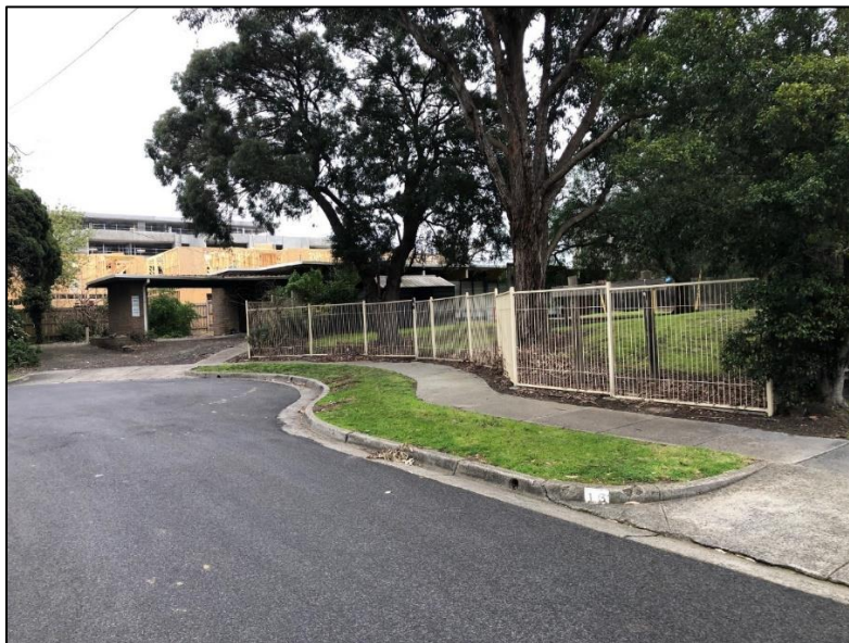
Photograph #1: 20 Neil Court, Blackburn South

Council has owned the two parcels of land contained within the Subject Property since 1962.