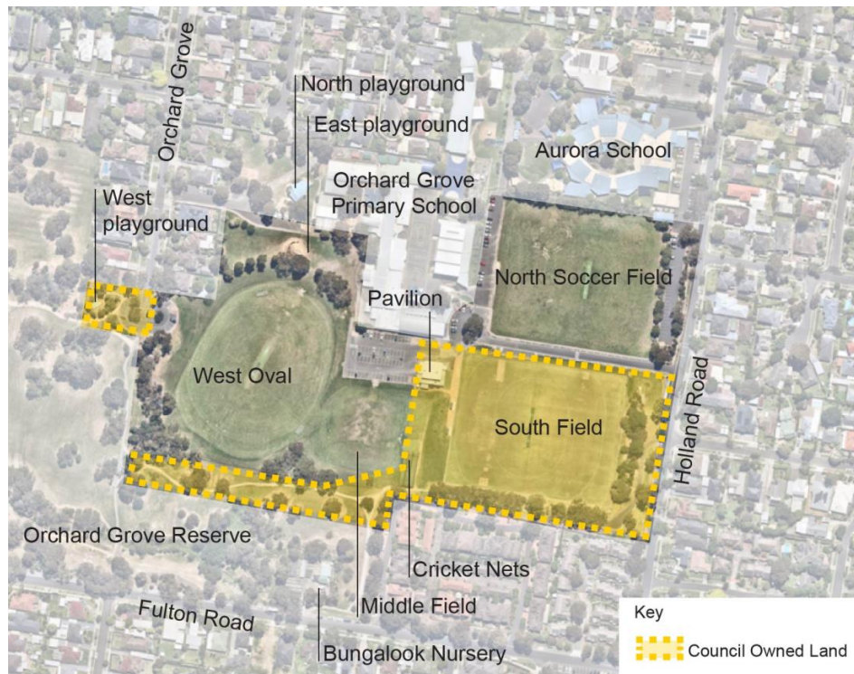
Figure 1. Mirrabooka Reserve Site Aerial Image, land ownership shown indicatively.

The need for a pavilion upgrade has been identified by the tenant clubs over a significant period of time as the existing facility is not adequate to support the club's participation growth. Both clubs utilise multiple ovals / soccer pitches concurrently for matches and training.