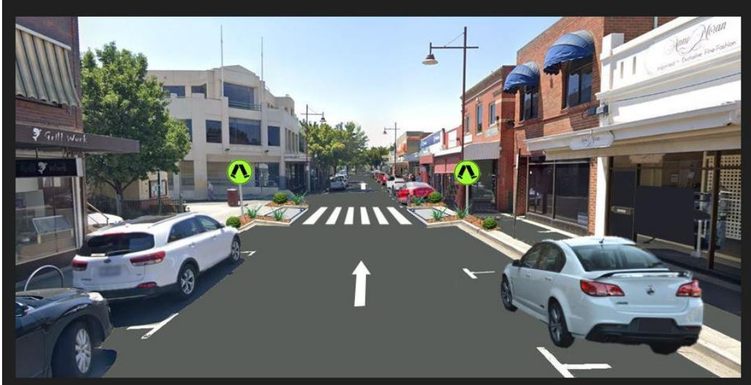
Figure 1 – 'One-Way' Traffic Arrangement